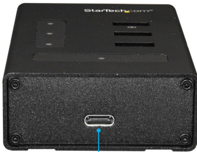
USB Type-C™ port (data only)