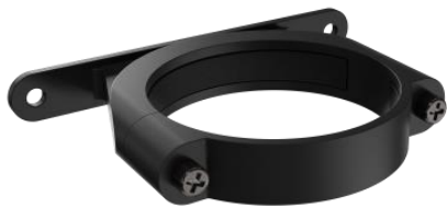
Pump-Reservoir Mounting Bracket