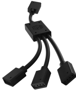
1 to 3 RGB Splitter