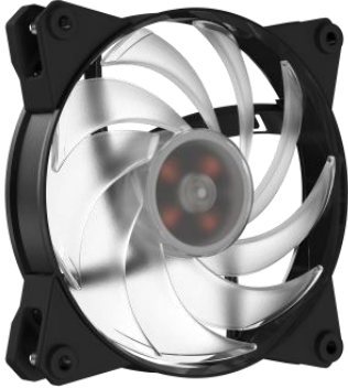
MasterFan Pro 120 Air Balance RGB