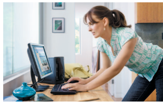
The 3rd generation Intel® Core™ processor can deliver amazing performance and stunning visuals with smart features that adapt to your needs.