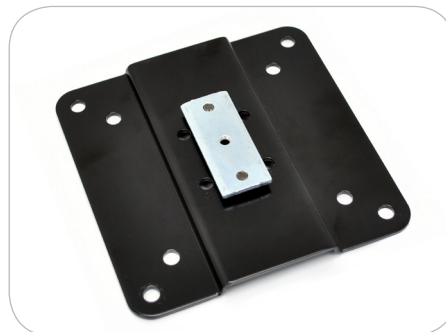
SV Rear VESA Mount Kit 97-512-009