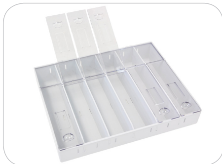
StyleView Medical Drawer Tray Accessory 97-450