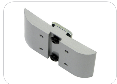
T-Slot Bracket 60-575-003