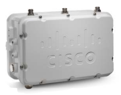
Figure 1. Cisco Aironet 1524

The Cisco Aironet 1524 is preconfigured with three radios compliant with IEEE 802.11a, 802.11b/g and 4.9GHz public safety standards. Various uplink connectivity options are supported such as Gigabit Ethernet (10/100/1000BaseT), and small form-factor pluggable (SFP) for fiber interface. Power options supported include 480VAC, 12VDC, Power over Ethernet (POE), and internal battery backup. It also employs Cisco's Adaptive Wireless Path Protocol (AWPP) to form a dynamic wireless mesh network between remote access points, while delivering secure, high-capacity wireless access to any Wi-Fi-compliant client device (Figure 2).