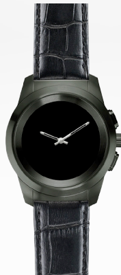
Black Embossed Leather