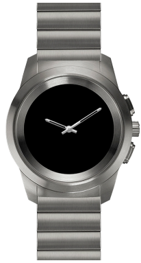
Titanium Modern Link