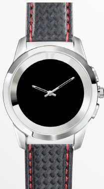
Carbon red stitching