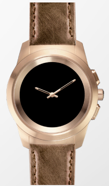
Brown Vintage Leather