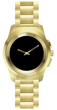
Gold Metal Link

Box size: 10.4*14 cm Box weight: 402.7 gr Packing (20 pcs per carton) Master carton size: 57.7*23.8*30 cm Master carton weight: 8,9 kg