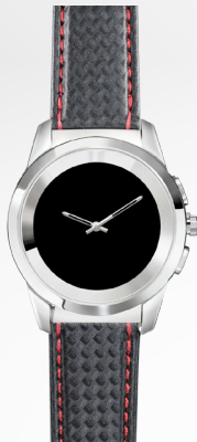
Carbon red stitching