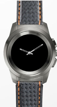
Carbon Orange stitching