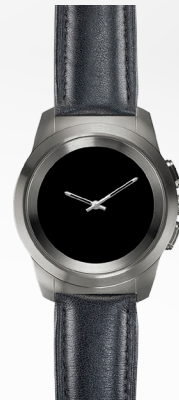
Black Flat Leather