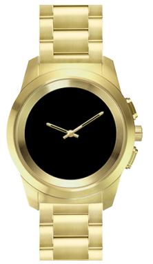
Gold Metal Link