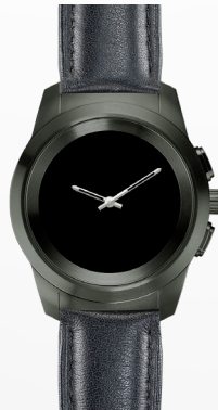
Black Flat Leather