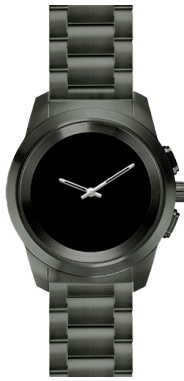
Black Metal Link