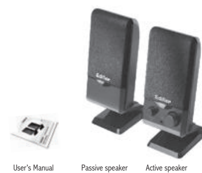
User's Manual Passive speaker Active speaker