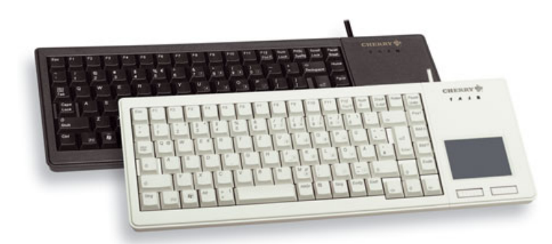
Models may vary from the image shown