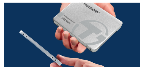
Ultra-slim 6.8mm form factor