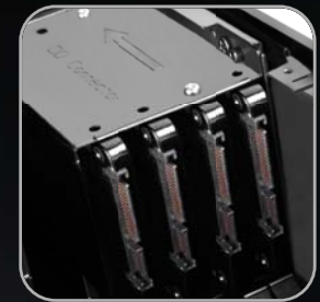
Support four 2.5" HDD/SSD