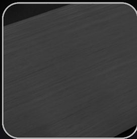
Aluminum front panel with premium styling