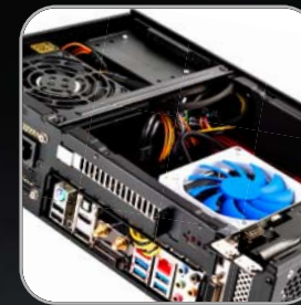
Support Mini-ITX motherboard and SFX power supply