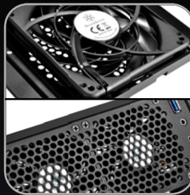
Includes one 120mm fan and support up to two 80mm fans