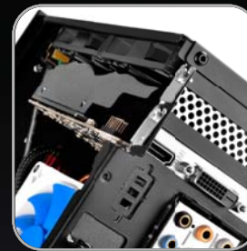
Support dual slot low-profile graphics or expansion card