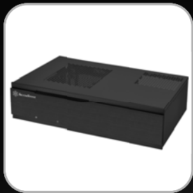
Super small at only 7 liters