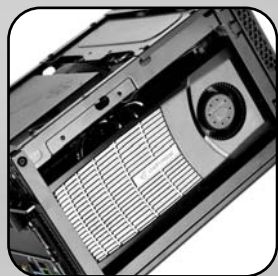
Support standard-length expansion cards (10.5 inches)