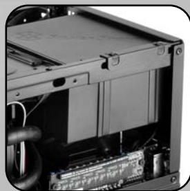
Mini-DTX / Mini-ITX motherboard & ATX PSU compatible