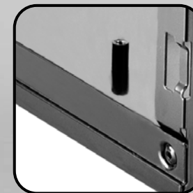
Elevated standoff for motherboard back side components