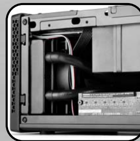
Support 120mm or 140mm single fan All-in-One Liquid Cooler