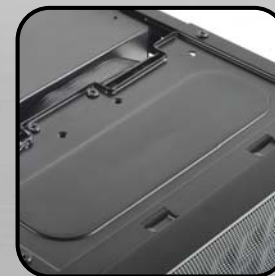
Support 2.5" and 3.5" hard drives