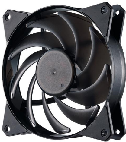
MasterFan 120 Air Balance x 2