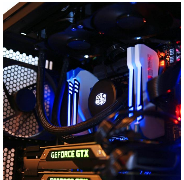
MasterLiquid in action