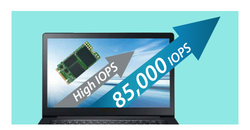
Built-in SLC caching technology

Utilizing the SATA III 6Gb/s interface, Transcend's ultracompact M.2 SSDs are well-suited to address the high-performance needs and strict size limitations of small form factor devices. By using only high-quality flash chips and enhanced firmware algorithms, Transcend's M.2 SSDs deliver peerless reliability.