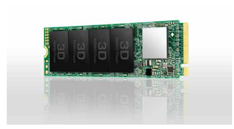
PCIe Gen3 x4 interface and NVMe standard

Transcend's PCIe SSD 110S utilizes the PCI Express® Gen3 x4 interface supported by the latest NVMe™ standard, to unleash next-generation performance. The PCIe SSD 110S aims at high-end applications, such as digital audio/video production, gaming, and enterprise use, which require constant processing heavy workloads with no system lags or slowdowns of any kind. Powered by 3D NAND flash memory, the PCIe SSD 110S gives you not only fast transfer speeds but unmatched reliability.