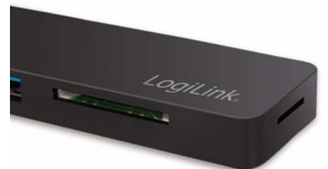
Support two memory cards at the same time