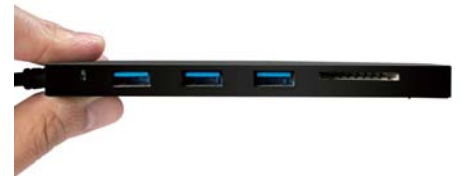
1cm Ultra-Slim thickness