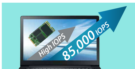
Built-in SLC caching technology

Utilizing the SATA III 6Gb/s interface, Transcend's ultracompact M.2 SSDs are well-suited to address the high-performance needs and strict size limitations of small form factor devices. By using only high-quality flash chips and enhanced firmware algorithms, Transcend's M.2 SSDs deliver peerless reliability.