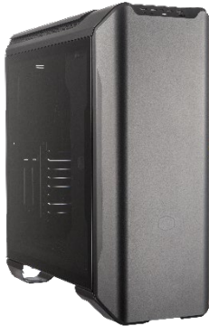
MasterCase SL600M Black Edition

As the Black Edition variant, the SL600M features a jet-black powder coat applied to premium aluminum panels.