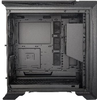
Vertical Chimney Effect Layout

As the Black Edition variant, the SL600M features a jet-black powder coat applied to premium aluminum panels.