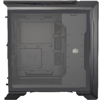
Noise Reduction Technology

With the 200mm fans that intake air from the bottom, hot air rises out of the case and exits out of the top in a natural direction for efficient thermal performance.