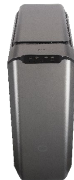
Advanced I/O Panel

The SL600M has versatile brackets that can mount an SSD, HDD, a water pump, or reservoir. These brackets can be placed in multiple positions inside the case, including being placed behind the front panel and on the bottom radiator bracket.