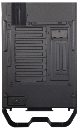
Rotatable PCI Bracket Window

The design of the panels address noise reduction by inhibiting noise from escaping toward the individual. The 2x200mm fans operate quietly in comparison to the volume of air they move and can operate even quieter by manually controlling the fan speed slider found on the I/O panel.