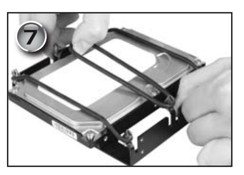
9. Fasten the last rubber band to the frame's central hook (fig. 7).

Never pull or press the rubber bands directly onto any electronics of the hard disk. It is harmless if the rubber bands touch the electronics, yet force must be avoided. Try to avoid placing rubber bands directly across processor chips of the hard disk as they might get hot.