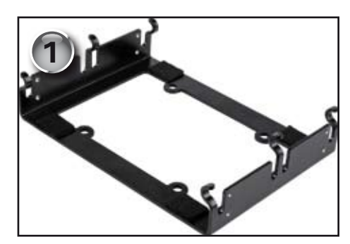
1. Apply the cushion pads to the frame (fig. 1).