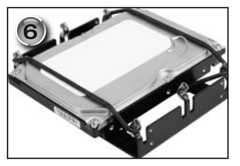
8. Slide the outer string of the second rubber band over the HDD and center the drive between the rubber bands (fig. 6).

Take care that the rubber bands will not be amaged by the HDD or parts of it.