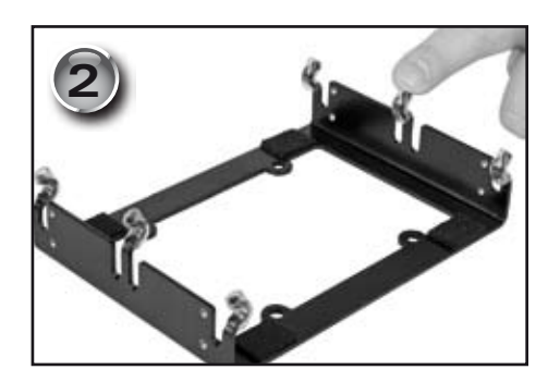
2. Slide the silicone covers over the 6 clamps of the frame (fig. 2).