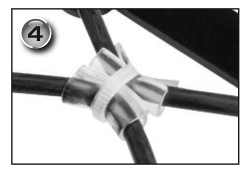
4. Two silicone covers come with a lengthwise cut. Slide these covers over both inner parts of the rubber bands (fig. 4).