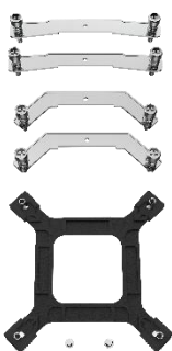
Upgraded Installation Brackets

4 heat pipes with silver nickel plated finish provide exceptional cooling and aesthetics