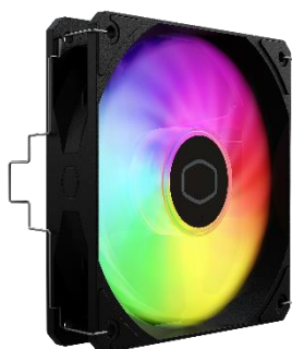
Spectrum ARGB Fan

120mm Spectrum ARGB fan certified for compatibility with Asus Aura, ASRock RGB, GIGABYTE and MSI RGB Motherboards. (Controller not included)