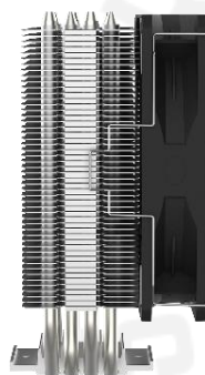
Wide Range Compatibility

120mm Spectrum ARGB fan certified for compatibility with Asus Aura, ASRock RGB, GIGABYTE and MSI RGB Motherboards. (Controller not included)