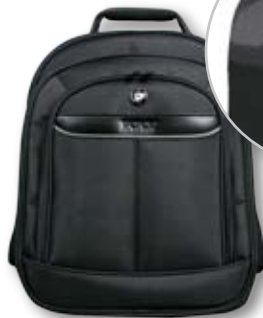
MANHATTAN 2 Backpack