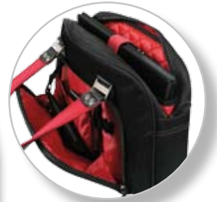
Compartments for Notebook & iPad