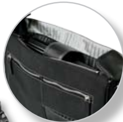
Compartments for Notebook & iPad