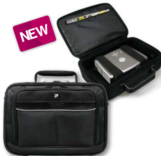
HOLLYWOOD Projector Case