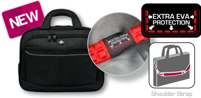
MANHATTAN PRO Topping