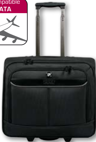
MANHATTAN 2 Trolley