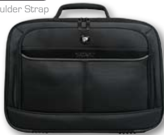
MANHATTAN II Clamshell