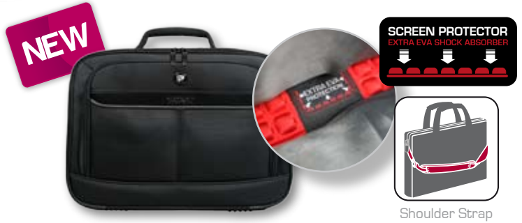
MANHATTAN PRO Clamshell