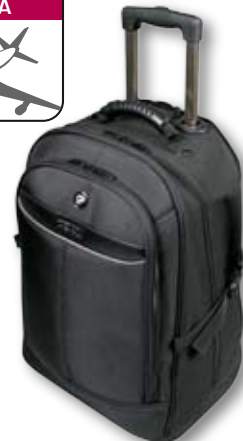
MANHATTAN 2 Backpack Trolley