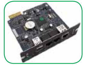
AP9631: Management Card