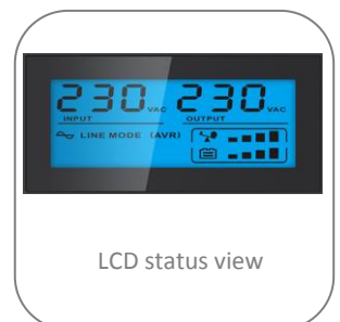
LCD status view