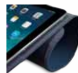
FLEXIBLE cover Etui FLEXIBLE