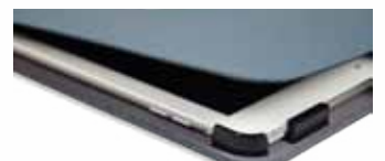
PROTECTIVE and MAGNETIC corners Coins de PROTECTION MAGNÉTIQUES