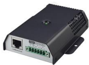
EMD for SNMP Manager Environmental Monitoring Device Monitor Temperature & Humidity Datasheet: Link Item No.: 10120544