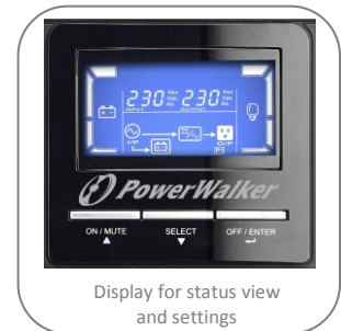
Display for status view and settings