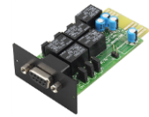
AS/400 Card Datasheet: Link Item No.: 10120515