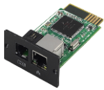
SNMP manager Datasheet: Link Item No.: 10120505