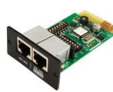
Modbus Card Datasheet: Link Item No.: 10120565