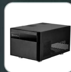
Cleanly styled SFF chassis with modernized layout