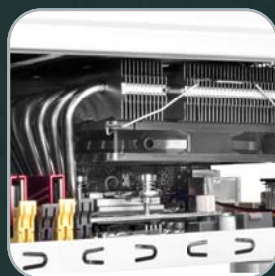
Ample space for CPU cooling (82mm in height)