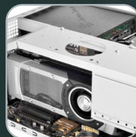
Micro ATX motherboard & ATX PSU compatible