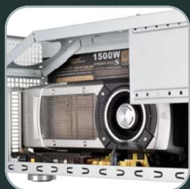
Support graphics cards of any length