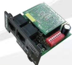
10120592 - Mini Modbus Card 3