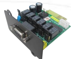
10120597 - Mini AS400 Card 4