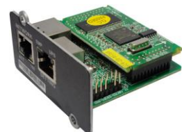
10120599 - Mini NMC Card