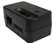
10120545 - EMD for NMC Card