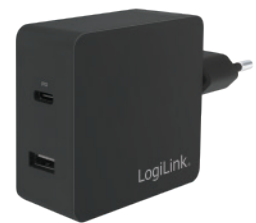
PA0212 USB-C™ 2-Port Wall Charger