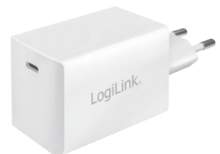
PA0229 USB-C™ GaN Wall Charger