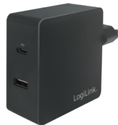
PA0213 USB-C™ 2-Port Wall Charger