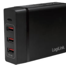
PA0122 USB Table Charger