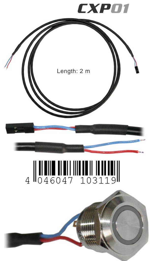
Note: Push button switch not included