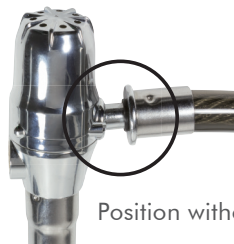
Position without Alarm