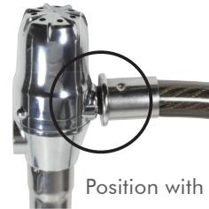
Position with Alarm

SC0211 is equipped with an alarm function. When the alarm function is active, an alarm is sounded for about 10 seconds if the lock is vibrated (such as during an attempted theft). The alarm is sounded again following each subsequent vibration.