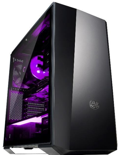
Just some example