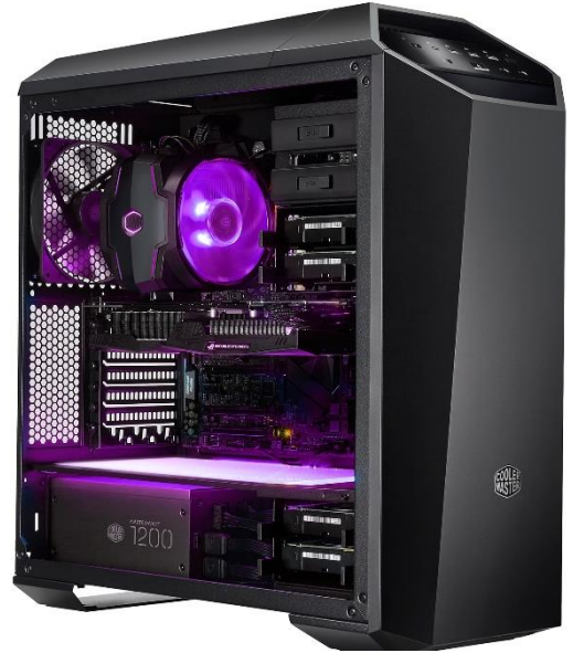
Just some example