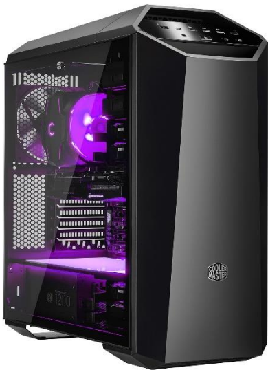
Just some example