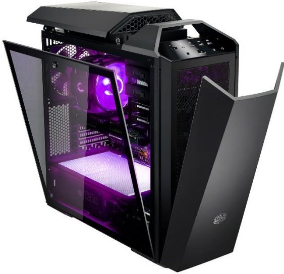
Just some example